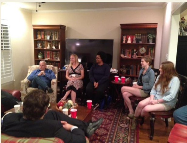
The Honors Salon, where students and professors discuss thought provoking ideas.