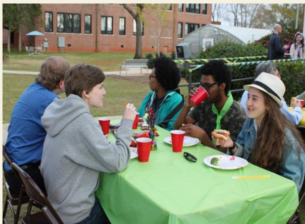
Students and professors chatting at the new members' party